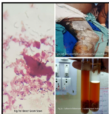
Fig.1a showing left leg extremity extensive sloughing of skin and soft tissue Fig.1b showing Direct Gram Stain Fig.1c showing Culture in Robertson's cooked meat media