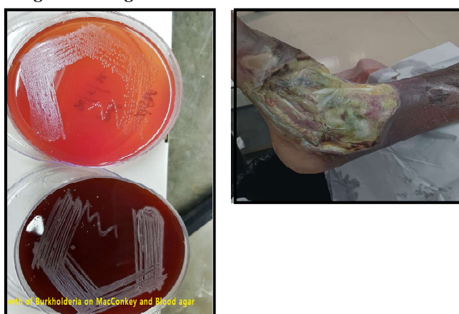
Fig.2 showing ulcerative lesion on the right foot Fig.3 showing growth of Burkholderia on Mac Conkey and Blood agar.

collected the pus samples from the multiple abscesses aseptically. Direct Gram stain from pus revealed plenty of GNB. ZN stain and KOH mount were non-contributory. Aerobic culture on MacConkey's agar and 5% SBA showed growth of oxidase positive, catalase producing NLF GNB colonies. Anaerobic culture and fungal culture were sterile. The final diagnosis was made by VITEK-2 compact system, as Burkholderia cepacia . He was treated accordingly with ceftazidime, carbapenems, followed by cotrimoxazole and responded well to therapy and was discharged with the advice to follow up.