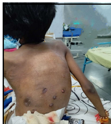
Fig.4 showing multiple non healing ulcers.